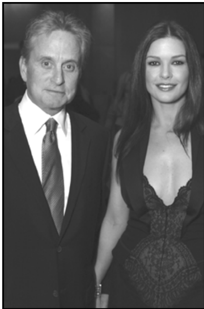
Michael Douglas and Catherine Zeta-Jones