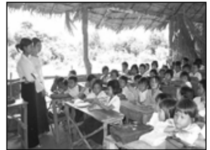
Students in Thatched School prior to AAM and CMAC funded renovations.

The minefields in this village CAM-002, 003, and 004 (Post-conflict clearance efforts in heavily mined areas are categorized as minefields and given code names) were adopted by funds from Adopt-A-Minefield campaigns and donors and cleared by the Cambodian Mine Action Centre (CMAC). After the